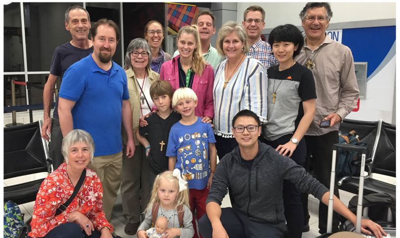
St. Mark's delegation coming home after our visit with Cordero de Dios congregation in El Salvador