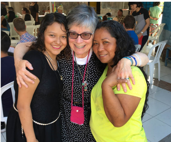
Relationship building at Cordero de Dios Lutheran Church