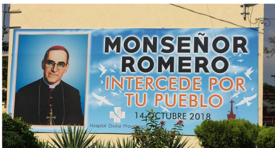
Archbishop Romero continues to influence the people of El Salvador. He was assassinated March 24, 1980