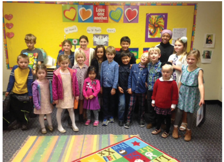
St. Mark's Sunday School