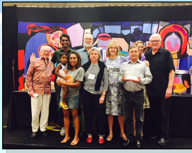
St. Mark's Delegation