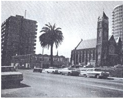
As the Square looked in 1966 with the tower completed.

During urban renewal in the 1960's when the old Victorian houses within a 40-block area met their fates with the wrecking ball (the last house to go abutted the east wall of the church), reconstruction