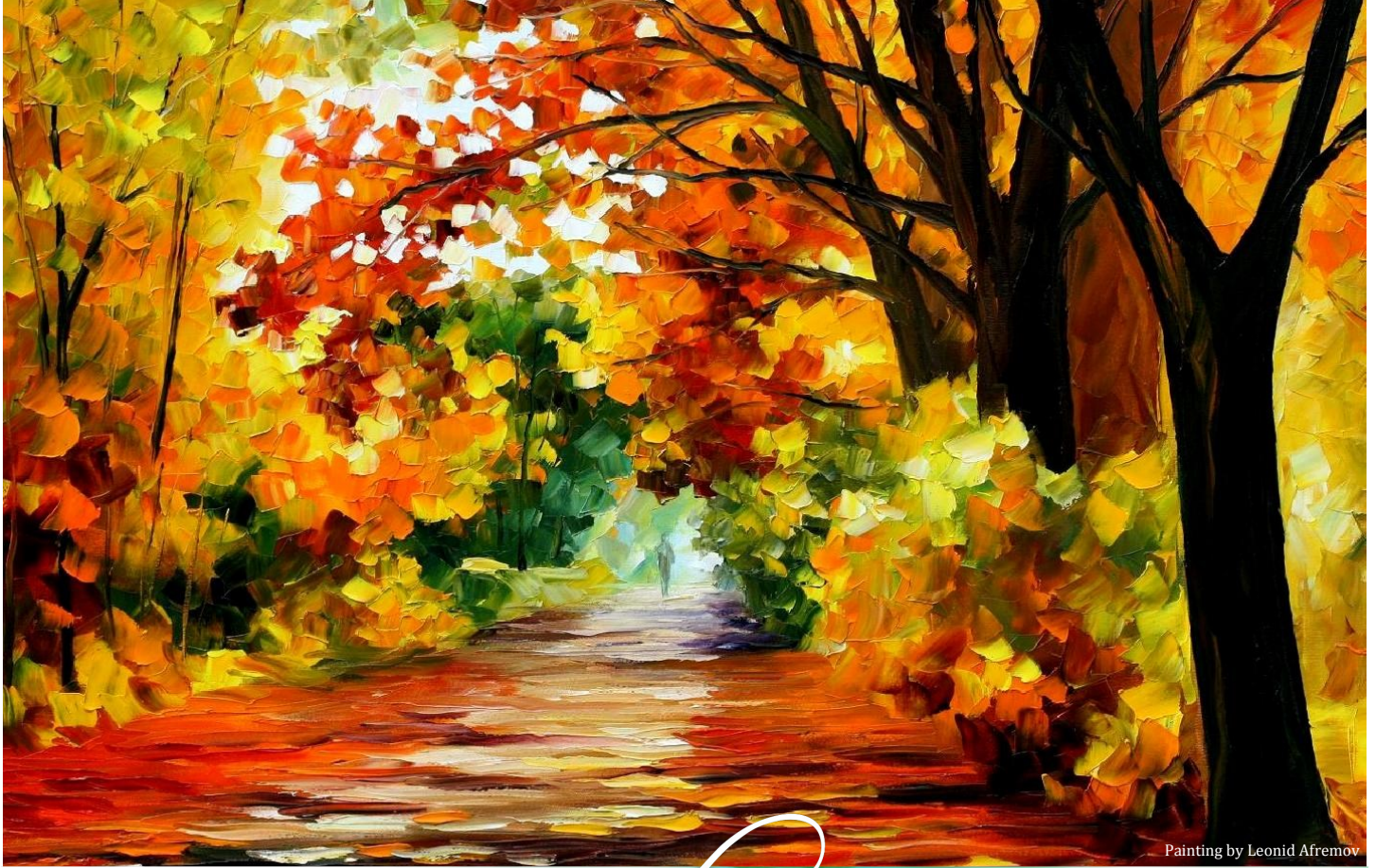
Painting by Leonid Afremov