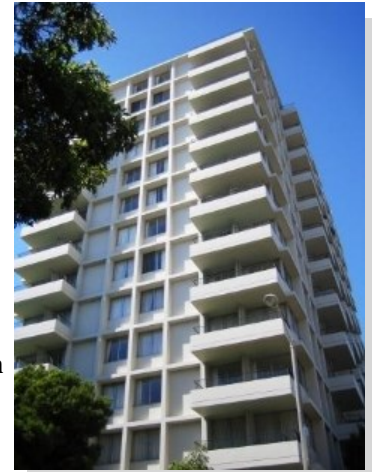
Current brochure advertising MLT shows the Tower "looking well".