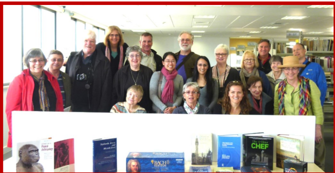
St. Mark's pilgrims in 2013 presenting gifts to the library of Dar Al-Kalima University

The anticipated cost for this trip is $1,685 per person for a double occupancy, and $2,025 per person for single occupancy. Airfare is anticipated to cost between $1,500 and $1,800 per person. Participation is open to everyone whether a member of St. Mark's or not.