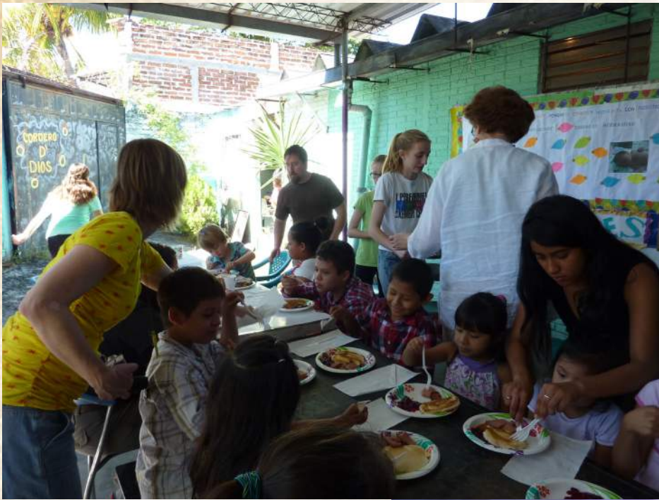
Pancakes for Thanksgiving 2014 at Cordero de Dios in El Salvador