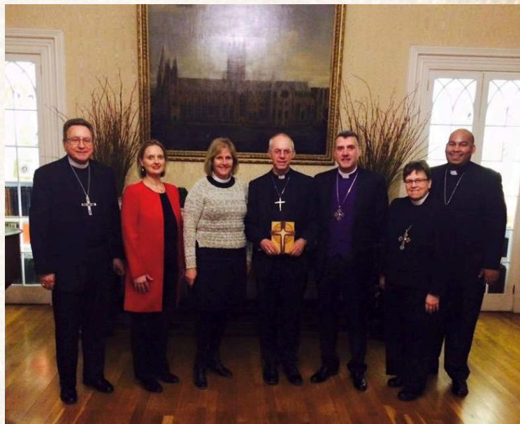
The ELCA Ecumenical Pilgrimage Delegation with Archbishop of Canterbury, the Most Revd and Rt Hon Justin Welby

Knowing of his passion for spiritual renewal and prayer, I asked him if he would recommend a spiritual practice to