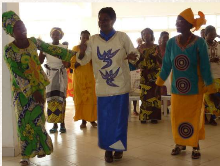
The women dance at Regina Pacis in Kigali, Rwanda. PICO Rwanda has brought them dignity and hope.