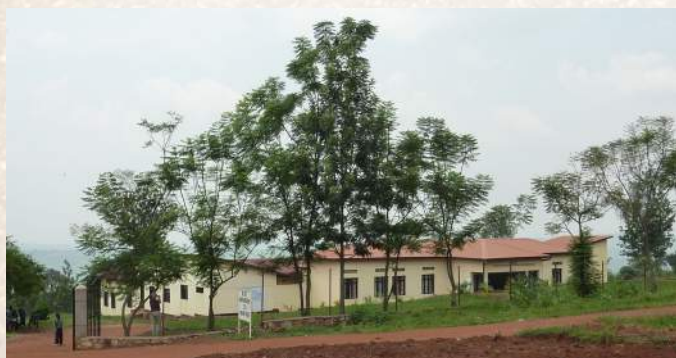
Top: Mumeya Clinic in Rwanda – mothers and babies can now be delivered safely in the community.