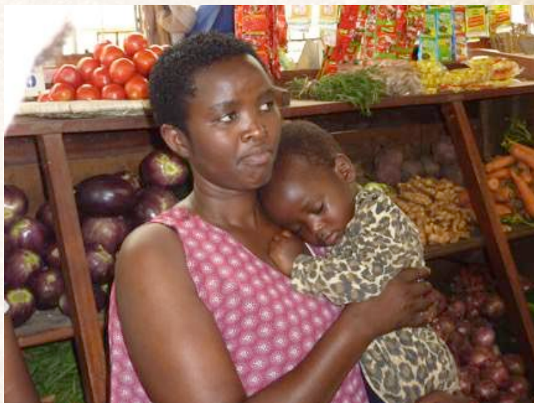
A woman from Regina Pacis has new hope for herself and her child. PICO Rwanda has empowered her and given her dignity.