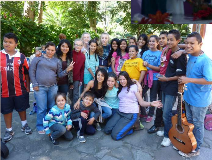
Youth from Cordero de Dios and St. Mark's had a great time together!