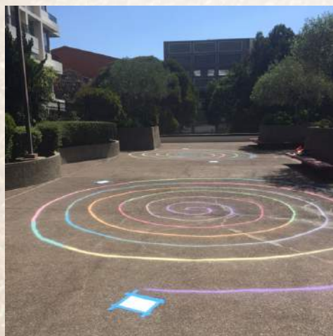
Labyrinth drawn in St. Mark's Square on God's Work Our Hands Sunday 2014