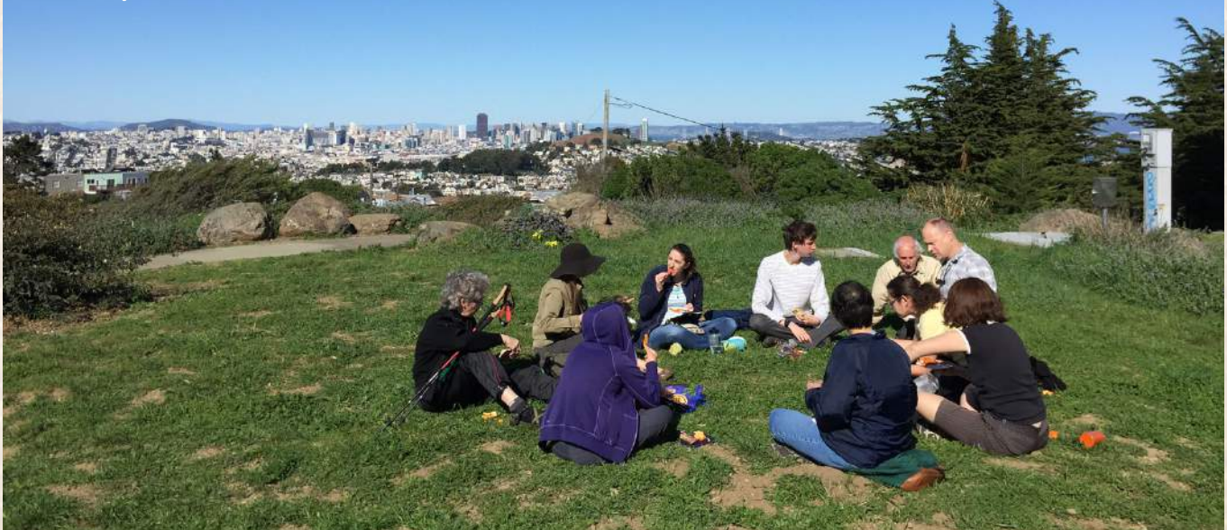
February 2015 "St. Mark's Our Planet" Hike at McLaren Park