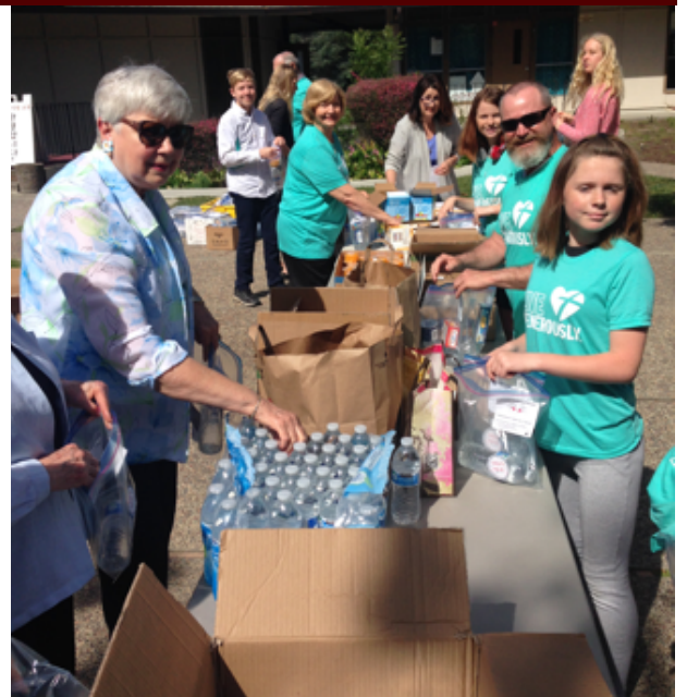
Members of Immanuel Lutheran Church in Saratoga assembling homeless kits for distribution by the congregation. These kits were funded through a 2017 St. Mark's Endowment Fund grant.