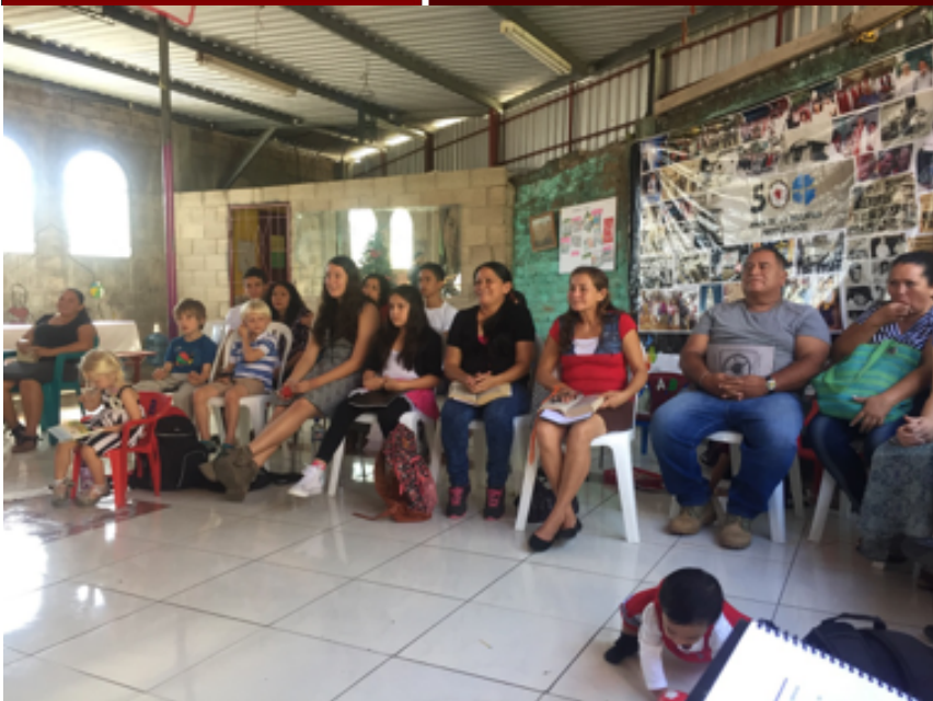
The congregation of Cordero de Dios in Soyapango, El Salvador, meeting in their recently renovated church. This renovation was funded, in part, by a 2016 grant from the St. Mark's Endowment Fund.